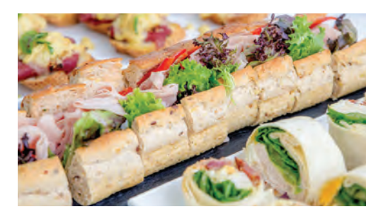
Speak to the Events team about bespoke grazing station options.